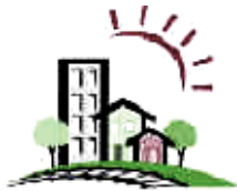
The city of EAST POINT Georgia

“PEARL is one of the best fire escape product options available to our residents ...”